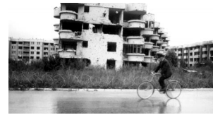
Sarajevo, 1996.

“An interesting phenomenon worth noting is the transformation of the SDA’s image, in part through the publication Ljiljan . As the dominant Bosniak Muslim party attempted to soften its image, it entered into a coalition with a few small civic-style parties. The SDA’s publication, Ljiljan , founded as Muslimanski Glas , has often advocated radical clerical-nationalist tendencies, bordering on fascism. So extreme was its views that it has at times been criticised by the SDA hierarchy itself. It has retained a harsh wartime rhetoric long after the Dayton agreements. Yet lately, it has attempted to transform into a moderate, European-style weekly with a slightly conservative and right of centre