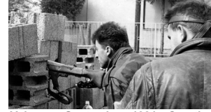
Vokovar, September 1991, Croatian militia defend the road out of town.

Though much maligned in the West, the decision to use focus groups appeared sound for two reasons. Firstly, very little testing of public opinion has ever been done in places like Phnom Penh or Tbilisi. Members of the public are not used to being asked for their opinions since they are not yet considered important enough. Secondly, they