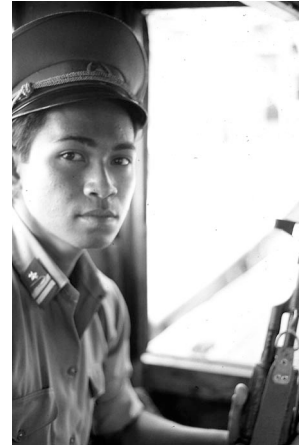
Cambodian soldier, 1990.