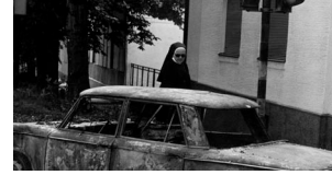
Vokovar, September 1991.

For all their success, these magazines and other independent media often fall short of minimum journalistic standards and sometimes engage in tabloid-style reporting, printing unconfirmed allegations based on less than thorough research.