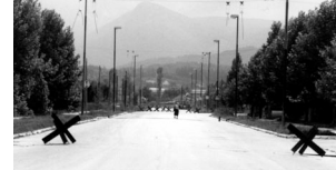
Sarajevo, 1996.

The Dayton Peace Agreement succeeded in ending a conflict in which no side was able to obtain a clear victory, but it failed to address the future of the media in the new state – except for a passing reference to media freedom in relation to elections. The agreement enshrined freedom of expression as a fundamental human right but set out no details as to the provision of public service broadcasting, transparent allocation of broadcast frequencies, public access to information held by governmental bodies or defamation legislation. This oversight has hampered the development of free media, pluralism, reconciliation and the implementation of the peace agreement. Incredibly, the international community once again neglected the role of the media when it set out the terms of the U.N. administration of the Kosovo province.